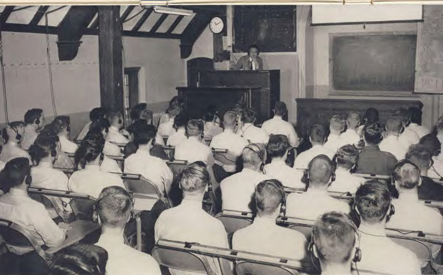
Students listening to a comprehension talk from tape.