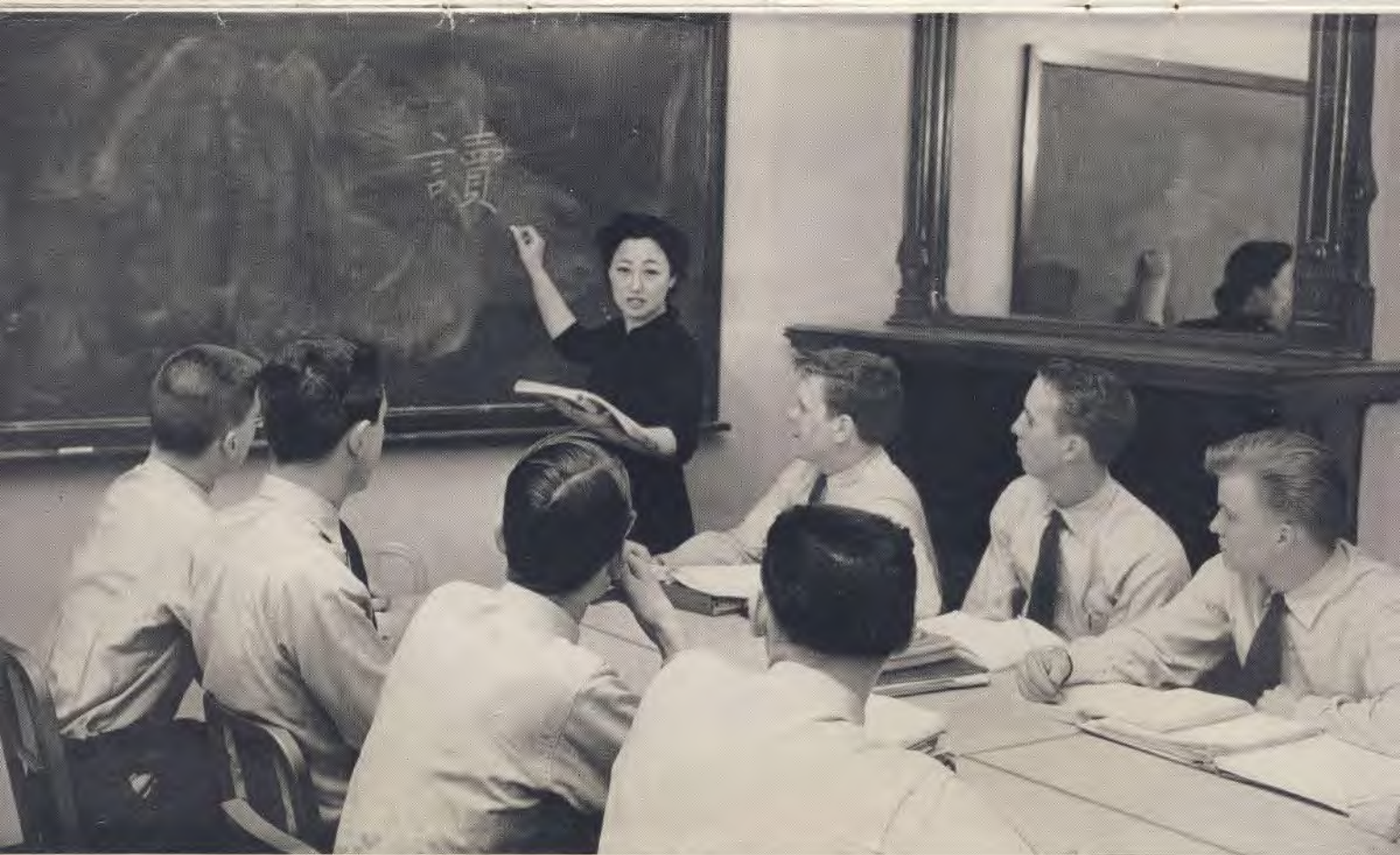
Instructors conducting drill classes.