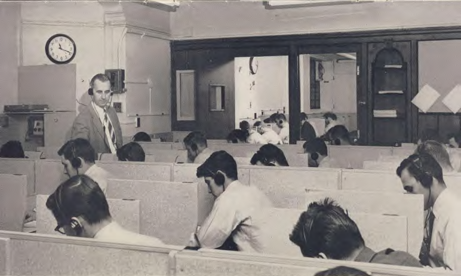
"Rapid Fire" exercise in the Sound Laboratory.