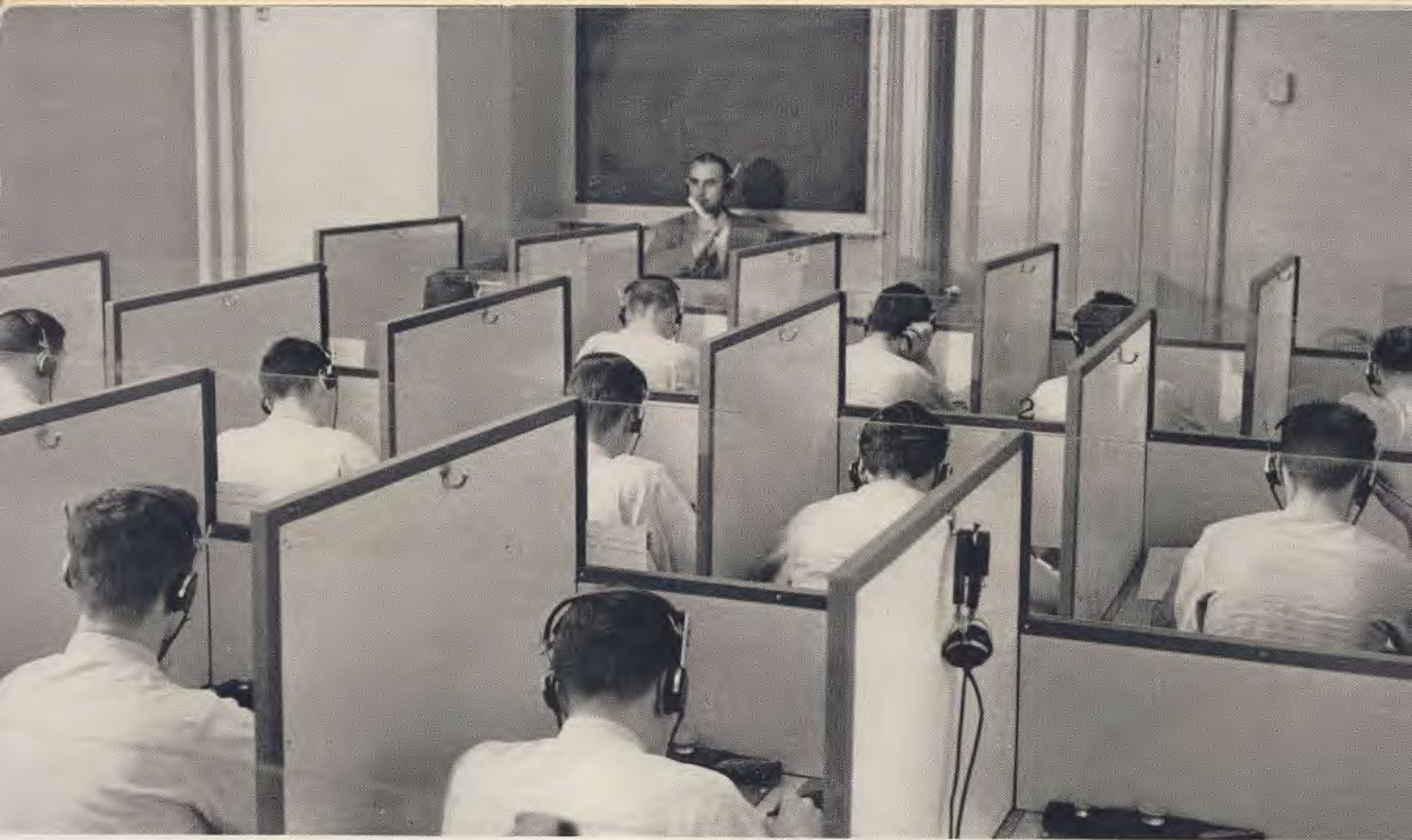
Individual study in a Sound Laboratory equipped with both tape and play-back machines.